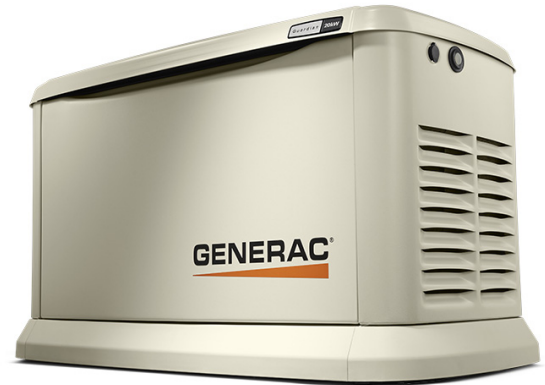
Product shown with optional fascia kit